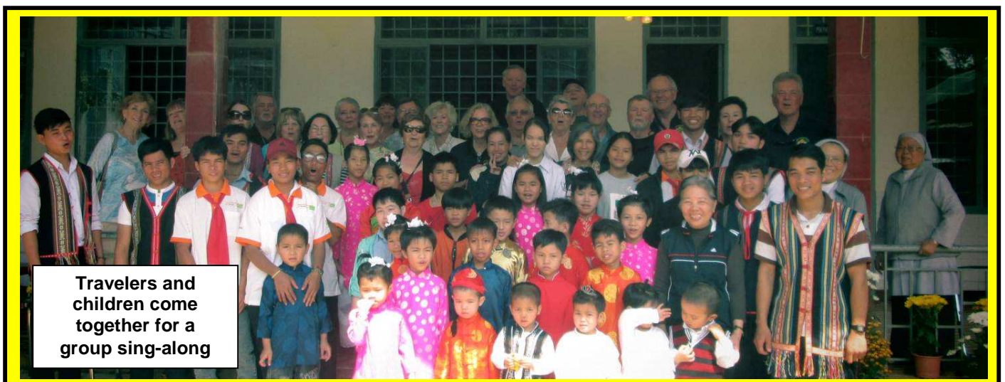
Travelers and children come together for a group sing-along