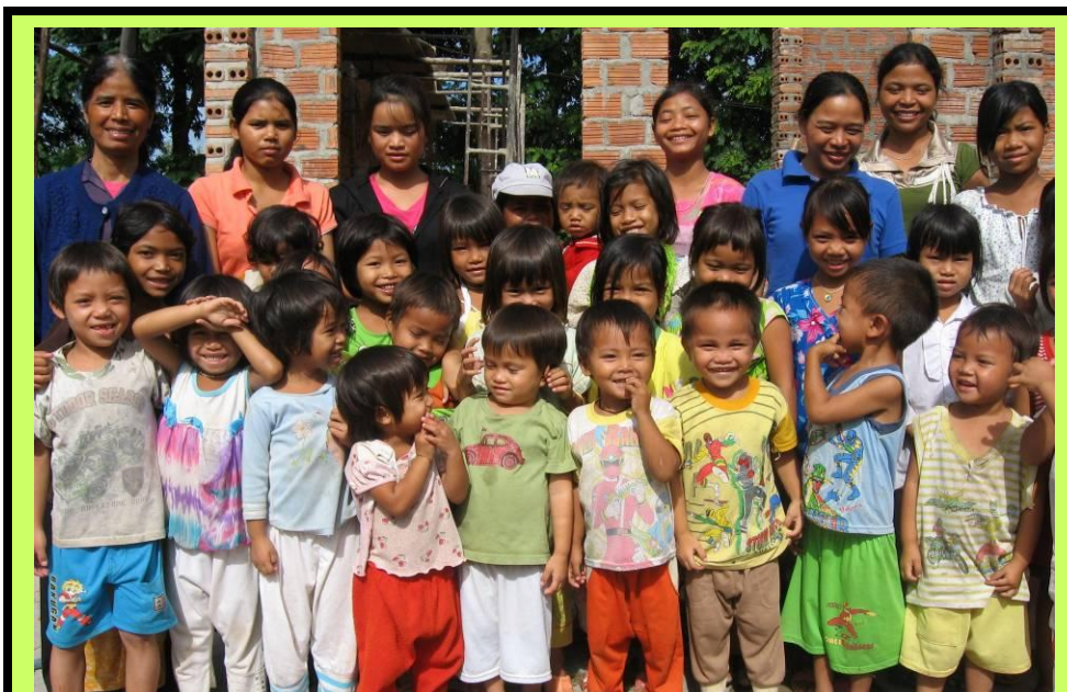
About 40 nuns & 40 lay care-givers tend to the needs of 800+ children.