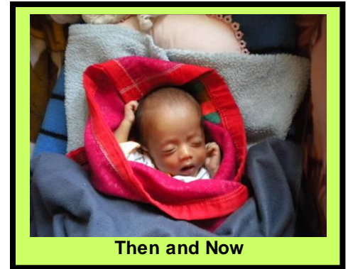
Then and Now