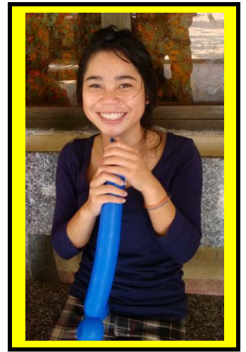
From balloons to bread rolls