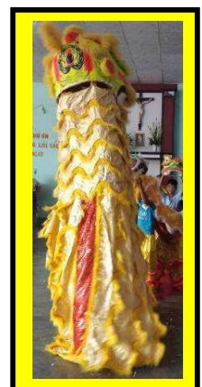
2018 Moon Festival