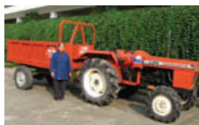
VS 4 Tractor that needs a shed