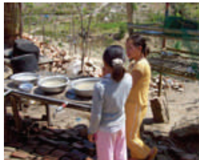
VS 4 Kitchen to be rebuilt by your donations

which mean projects, as described above. Each of you has served a cause greater than your self interest. The children are blessed because you care.