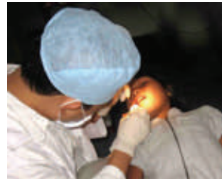
Child receiving dental care from VSO Donations